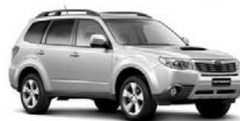
Subaru Forester 2009 S.U.V. of the year

Your Subaru will come with an honest deal and an honest dealer!