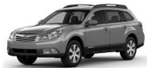
Subaru Outback 2010 S.U.V. of the year